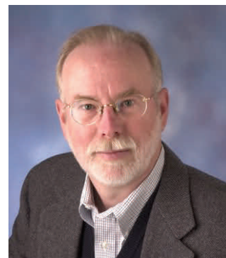
Geography Department DEO

Our students continue to fare very well. As you can see elsewhere in this newsletter, one of our students has earned a nationally-competitive Truman Scholar award. This is a notable distinc-