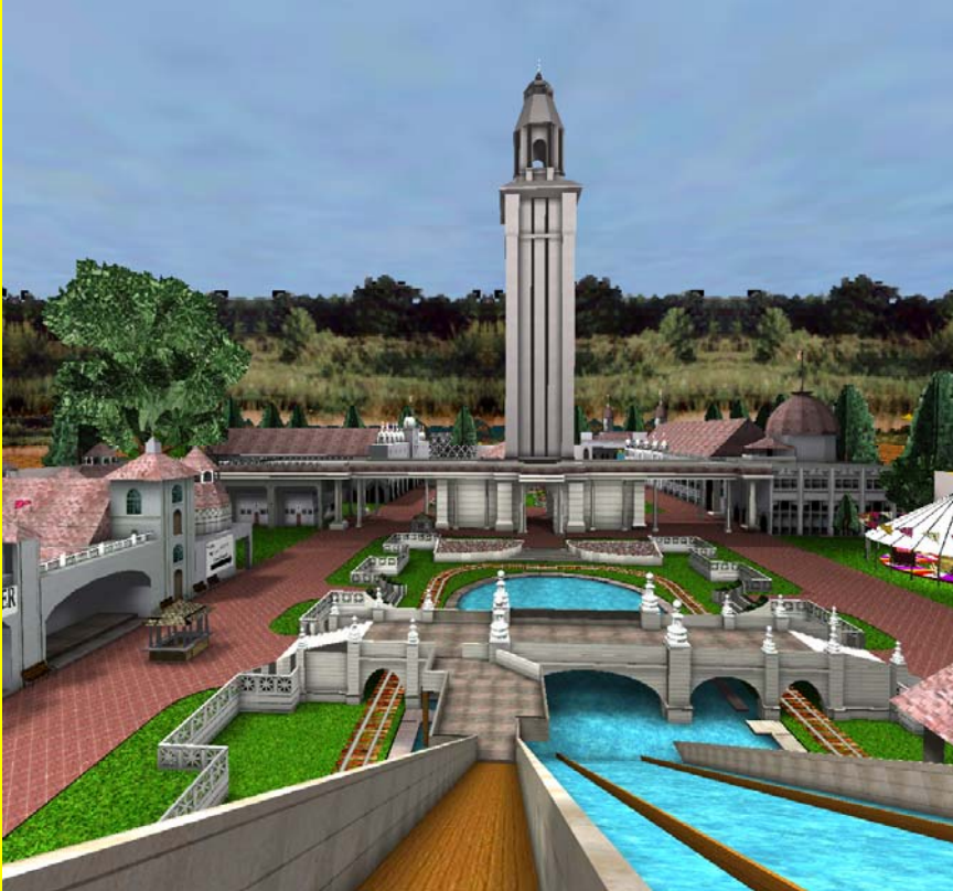
Recreation of a 1900's Amusement Park

The technology to develop multi-user, stereo 3D immersive environments - once the exclusive domain of highly specialized departments - is now available on the desktop. Personal computers, using multi-player, 3D game engines, are now powerful enough that inexpensive systems can be configured containing much of what is needed to create and display 3D stereo immersive environments.