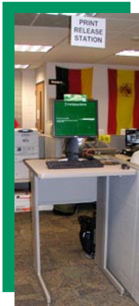
Print release station.

Since January, we have had a new and improved printing system to manage printing in the ITCs on campus. Students now pay for printing after it's done instead of pre-paying. Jobs are sent to a print queue and then held for release at a Print Release Station until the student is ready to pick them up. The best new feature, however, is remote printing. Students can load a client program on their own computer, enabling them to print to ITC printers using their HawkID. We have installed the print client on the computers in our small