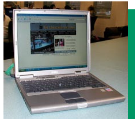
Dell D600 laptop.

Something else that we hope will improve our users' experience in the LMC is the addition of five Dell D600 laptops that can be checked out at the Front Desk. These laptops, which all have wireless capabilities and are able to print to the ITC printers, are available for students to use within the LMC.