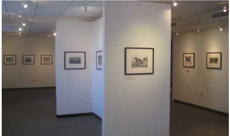
Top: The Kent Exhibit currently featured in the Old Capitol Museum. Left: Photograph of Fred W. Kent, courtesy of the State Historical Society of Iowa.

UI Through the Lens of Fred W. Kent exhibits photos from the University of Iowa Archives' Kent Collection from the 1920s to 1960s. Kent, once a photographer and instructor at the University, took numerous photos from all aspects of campus life. The Kent photographic archive contains more than 50,000 prints and negatives. The exhibit features many photographs that are not often displayed.