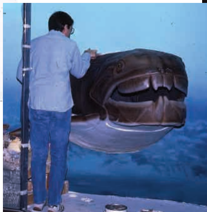
Finishing touches are added to the Dunkleosteus in the Devonian diorama.