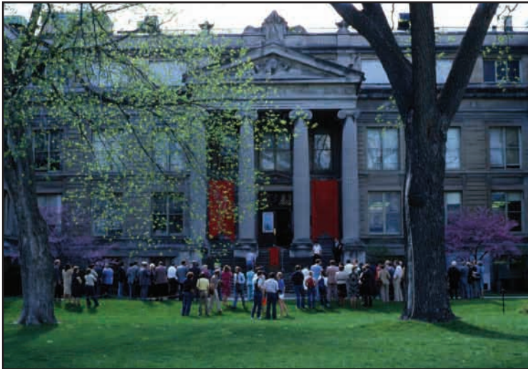
Photograph from the opening of Iowa Hall May 11, 1985.

Just a few years after celebrating its sesquicentennial, the University of Iowa Museum of Natural History has another important milestone to celebrate. This May marks the 25th anniversary of the opening of the Iowa Hall gallery, which has become a vital educational resource for the University and the surrounding community.