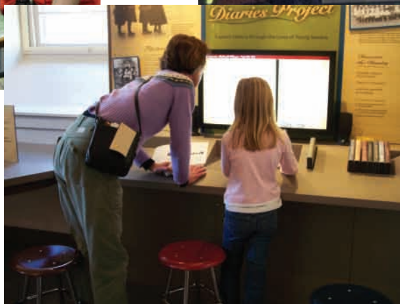
Left: Visitors at Old Capitol view the Iowa Youth Diaries Project.