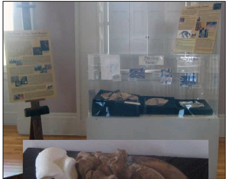
Top: Portion of the sloth exhibit in the Old Capitol Museum. Right: Bones from the hand of the adult sloth articulated in the exhibit.