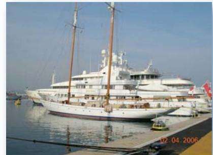
The view at Nice. If you look hard enough, you may see Lake Macbride.

tem using tugs and outboards is observed. I don't want to poach on harbor-master responsibilities, but it is very much a safety issue.