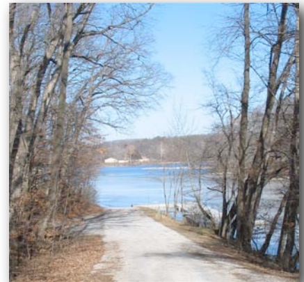
Wet water in the middle; ice in the cove!!

As of Sunday, 2/5, the kitty held $7.75. Names were evenly spread out between Valentine's Day and the middle of May. And the middle of the lake was wet, but the cove was ice-bound. (Also forecasters predict below freezing temperatures for at least the next 5 days.)