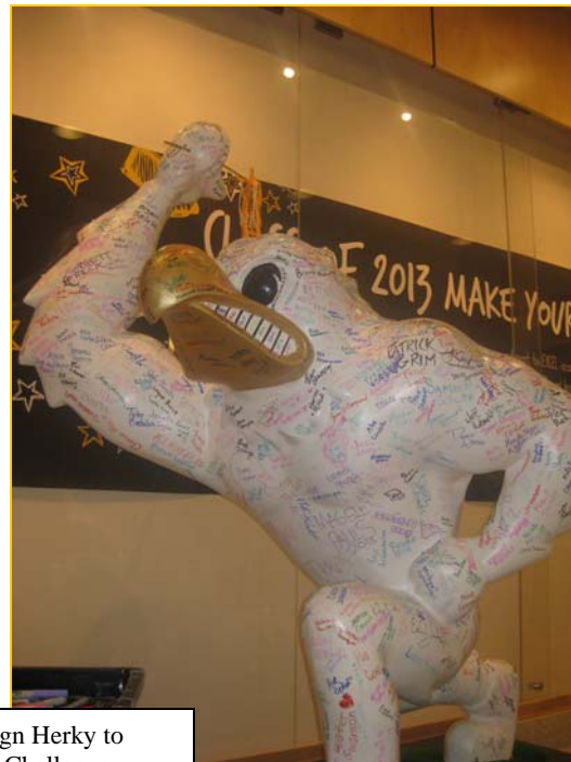
Students completing Orientation were asked to sign Herky to show their commitment to upholding The IOWA Challenge.

The IOWA Challenge committee has also generated additional strategies for integrating the Challenge into classrooms and student programs.